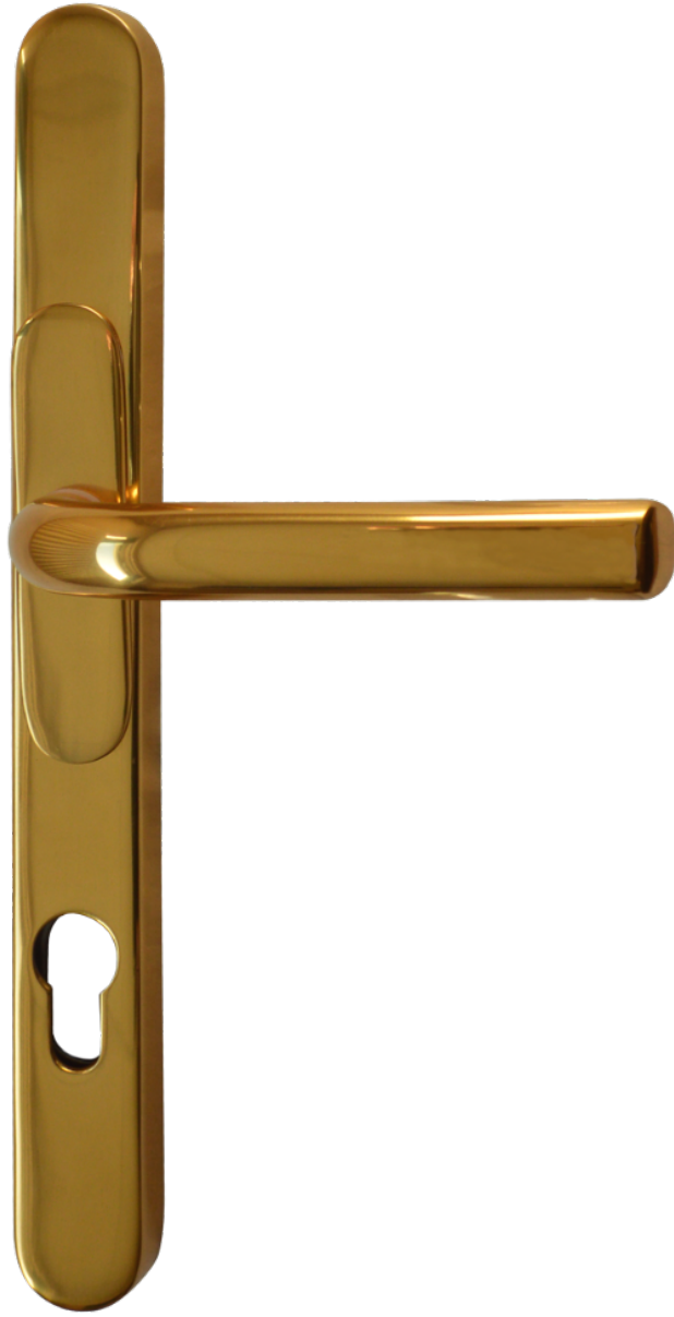
CH30090 59-96mm Centres - Gold