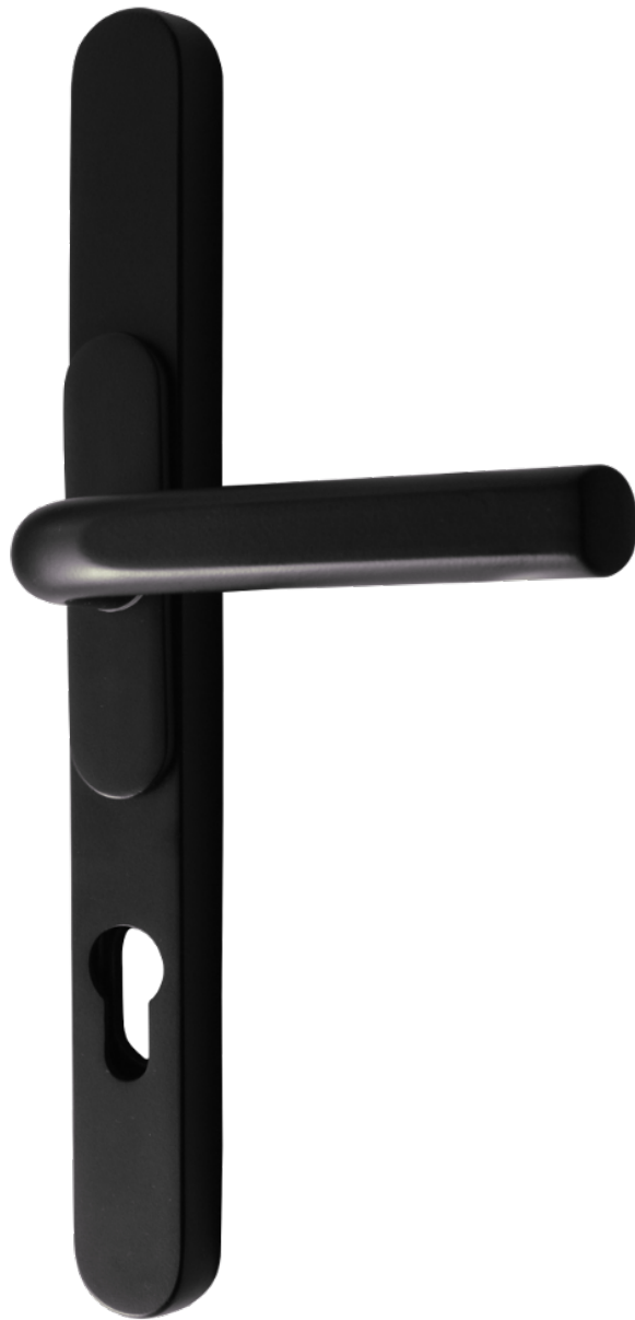
CH30087 59-96mm Centres - Black