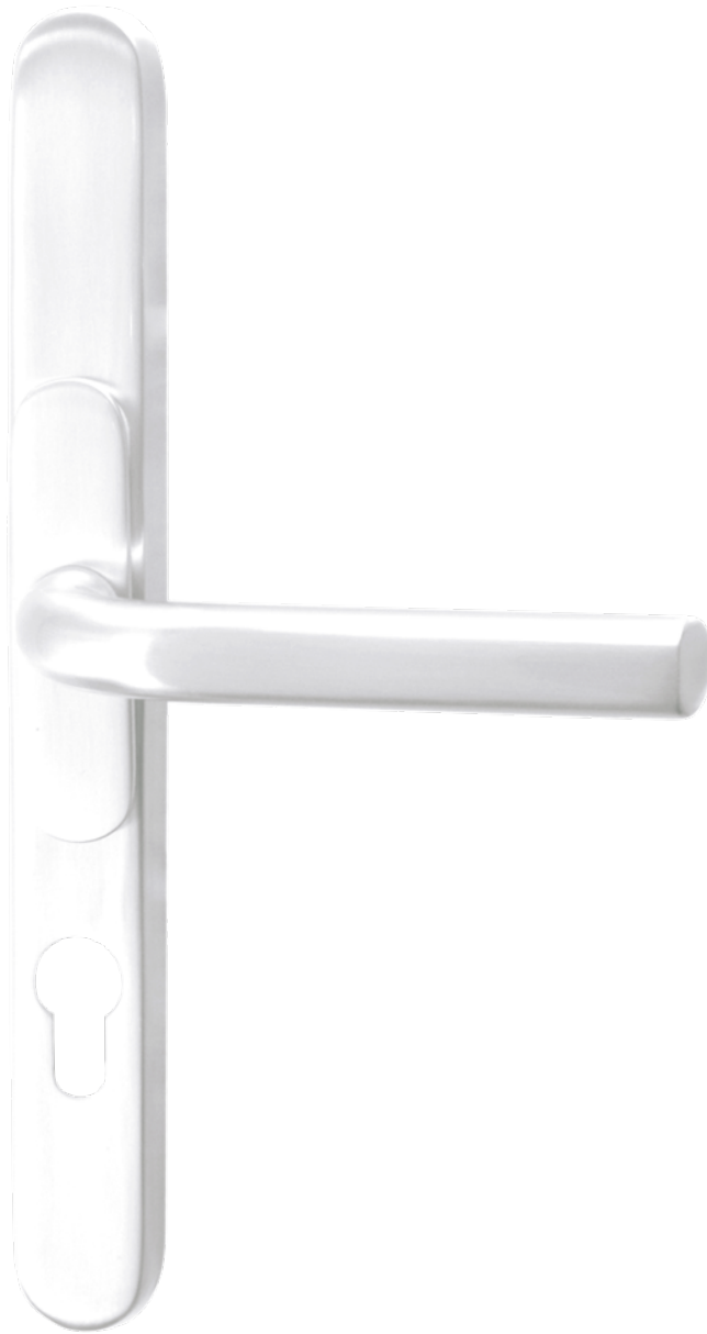
CH30086 59-96mm Centres - White