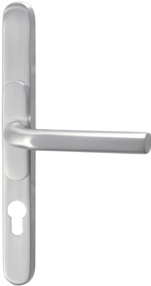
CH30089 59-96mm Centres - Polished Silver