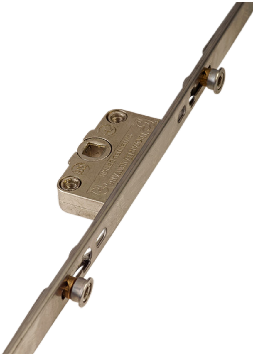
L29002 Size 5 – 1250mm